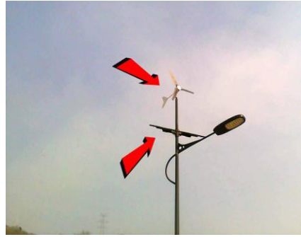
Fig. 3. Lamp assembly of wind power and solar energy along the street.[4]

Resources as depth space energy are utilized mostly by continuous extending and copying at one point. For instance, solar energy, wind power and geothermal energy are resources unlimitedly obtainable at one point. Plant energy is also a sort of resource planted, harvested and obtained at one point, running in cycle.